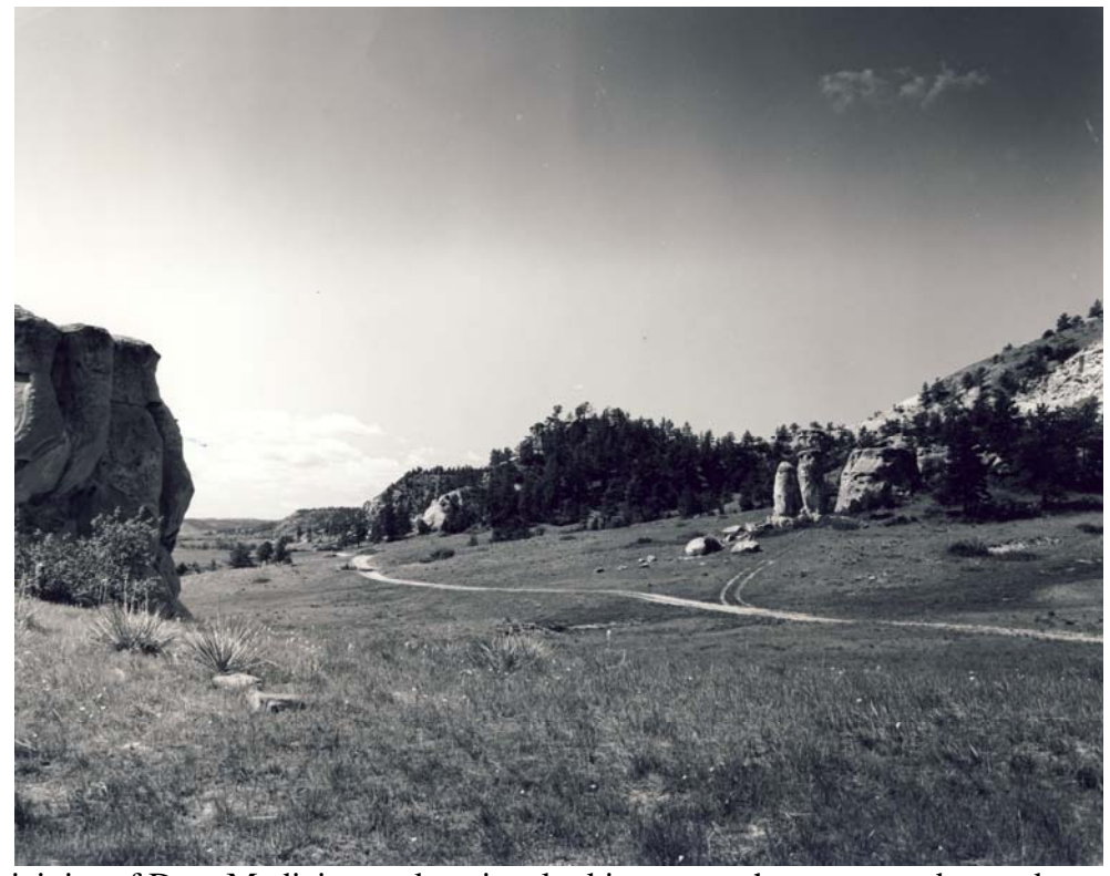
View in the vicinity of Deer Medicine rocks, view looking to southwest toward a sandstone outcropping of Deer Medicine Rocks. Roger Whitacre, May 15, 2007.