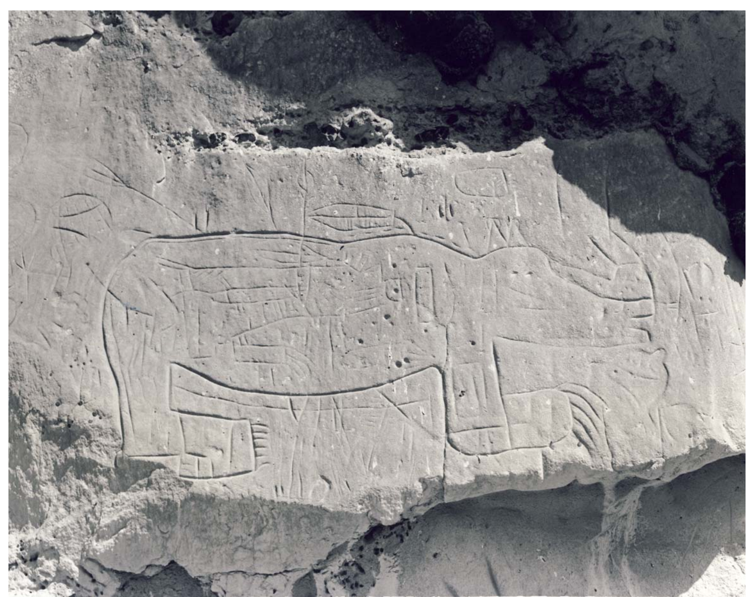
Inscriptions on Deer Medicine Rocks.