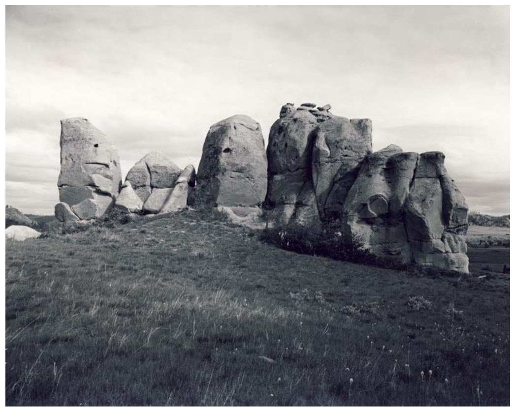
General view of Deer Medicine Rocks, view looking to the east. Roger Whitacre, May 15, 2007.