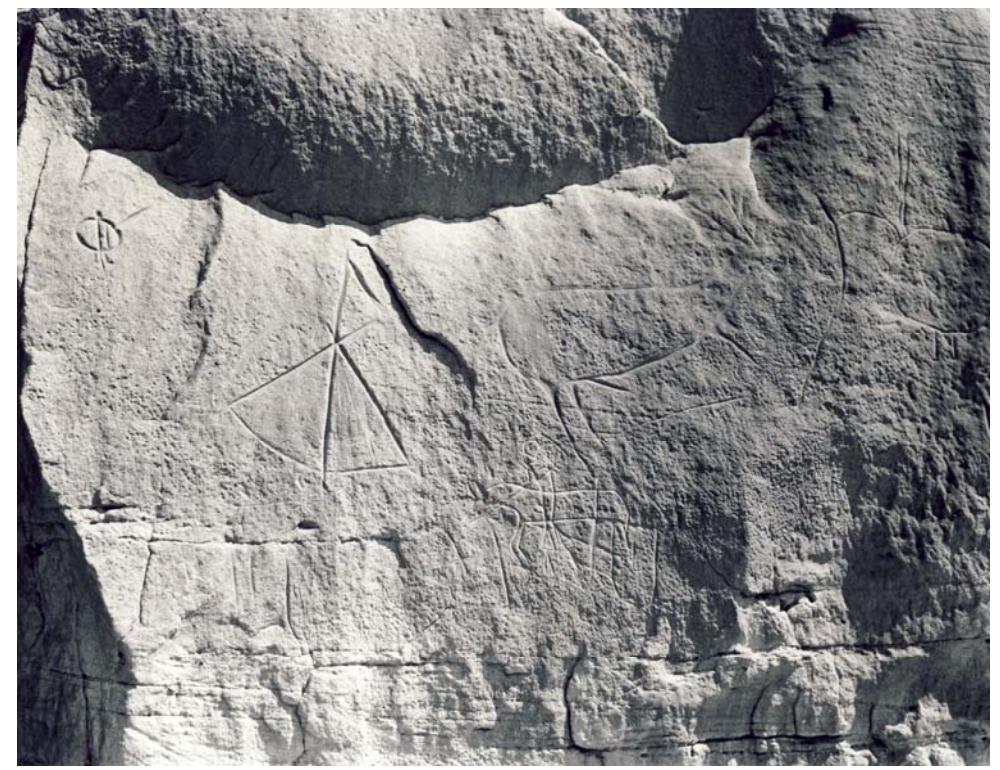
Inscriptions on Deer Medicine Rocks.