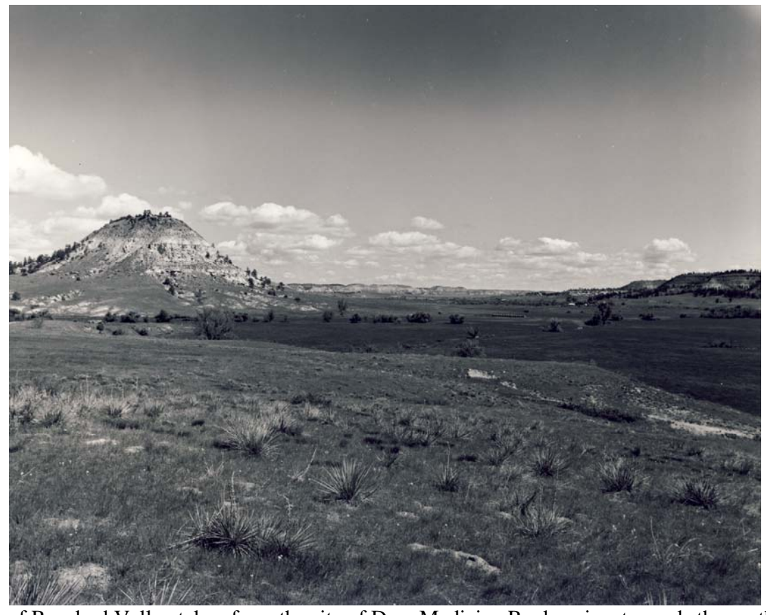
View of Rosebud Valley taken from the site of Deer Medicine Rocks, view towards the northeast.